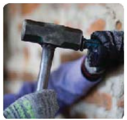
SOLD PER PAIR For Gloves with Padding on the Left Hand #DP470031 (M /8), #DP470041 (L /9), #DP470051 (XL /10)

For Gloves with Padding on the Right Hand #DP470032 (M /8), #DP4700421 (L /9), #DP470052 (XL /10)